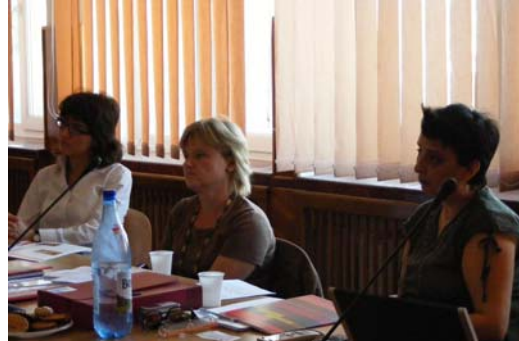
We really had a lot of work to do