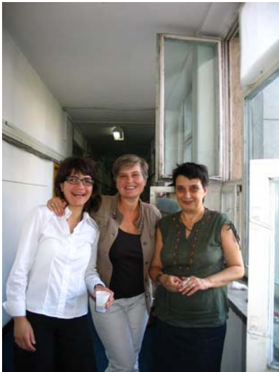
We also had a great time together!